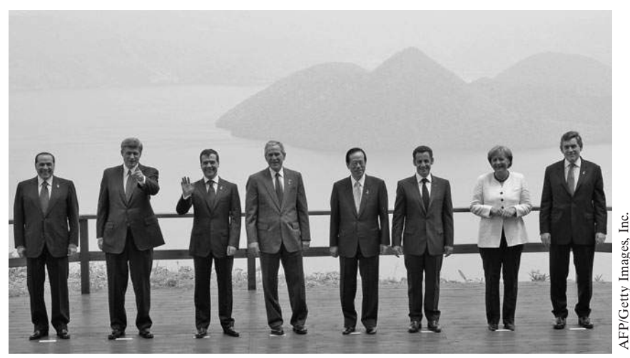
Group of Eight (G8) leaders met at the Toyako Summit in Japan in July 2008 to tackle a number of impending issues including climate change, the food crisis, and oil supply stability.

Russia joined the G7 in 1997, and the group consisting of the original G7 and Russia is known as the G8. Heads of state, senior economic ministers, and heads of central banks typically meet once a year to further economic coordination. G7 meetings have primarily dealt with financial and macroeconomic issues (such as the Asian and Latin American financial crisis), but since Russia's participation, the G8 has included some politically sensitive issues such as an effort to make arrangements for the reconstruction of Kosovo-and indeed of the Balkan states as a whole-after the Kosovo conflict. Recently, as a result of a remarkable economic and democratic transformation, Russia has demonstrated its potential to play a full and meaningful role in addressing the global problems with the seven industrialized nations. The Group of Eight industrialized nations, in a G8 summit meeting in Calgary, Canada in June 2002, agreed to have Russia become the group's president and host the summit meeting in 2006.<sup>75</sup>